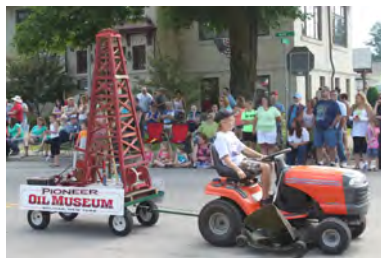
The parade entry from the Pioneer Oil Museum