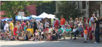
A large crowd enjoyed the weather on parade day