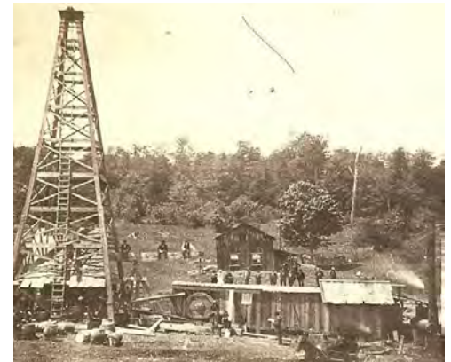
Photo of Triangle No. 1, the first commercial oil well in Allegheny County