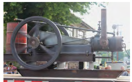
Above - a working oilfield engine in the Pioneer Oil Days parade