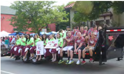
Both the Bolivar-Richburg girls' softball and boys' baseball teams made it to the state Final Four in June