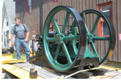
Denny Griesbaum ran this 15 HP Olin engine in the parade; notice the burning yellow dog on the trailer