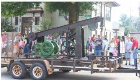
Another working model of an oilfield jack and engine that were in the parade